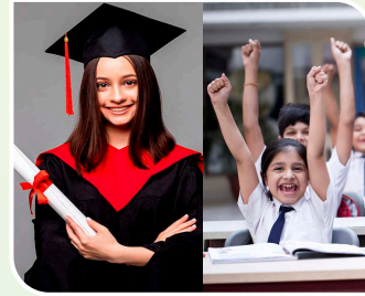
NEAR BY SCHOOLS & COLLEGES