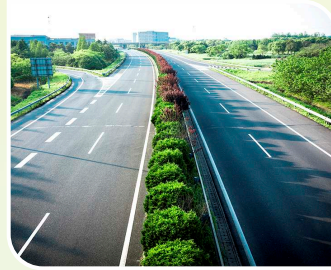
CENTRALLY LOCATED BETWEEN OMALUR, ELLAMPILLAI & THARAMANGALAM