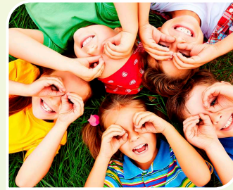
SAFE ENVIRONMENT FOR CHILDREN