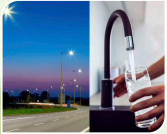
STREET LIGHTS & INDIVIDUAL WATER PIPE LINE