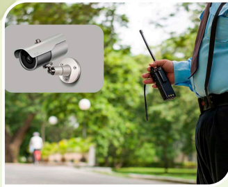
CCTV SURVEILLANCE & SECURITY