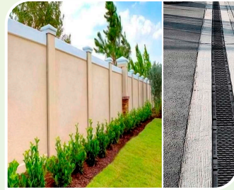
SECURED COMPOUND WALL & DRAINAGE SYSTEMS